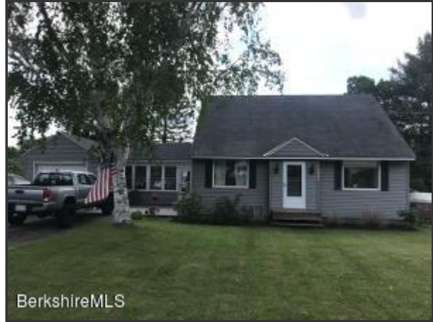
271 East St, Lee, MA