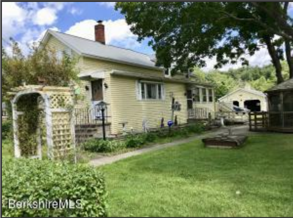
780 Greylock St, Lee, MA