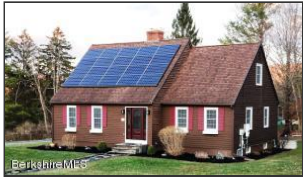
65 Via Maria --, Lee, MA