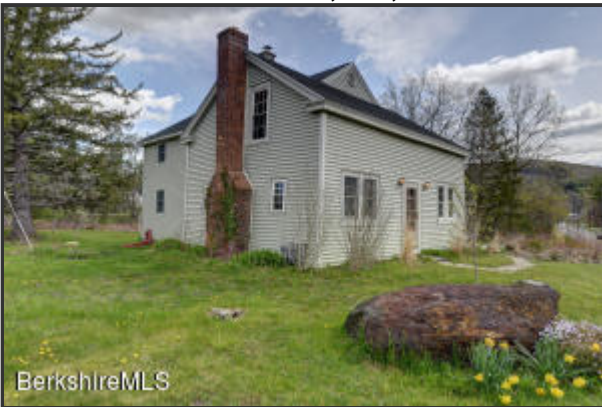
161 Center St, Lee, MA