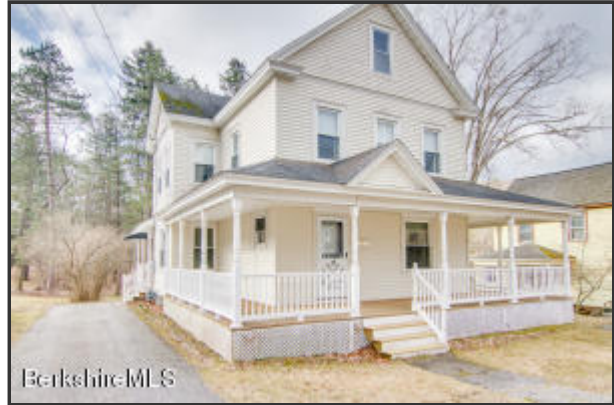
56 East Center St, Lee, MA