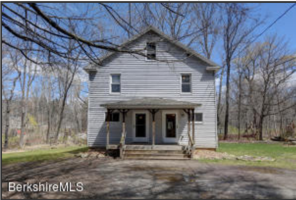
41-43 Robert St, Lee, MA