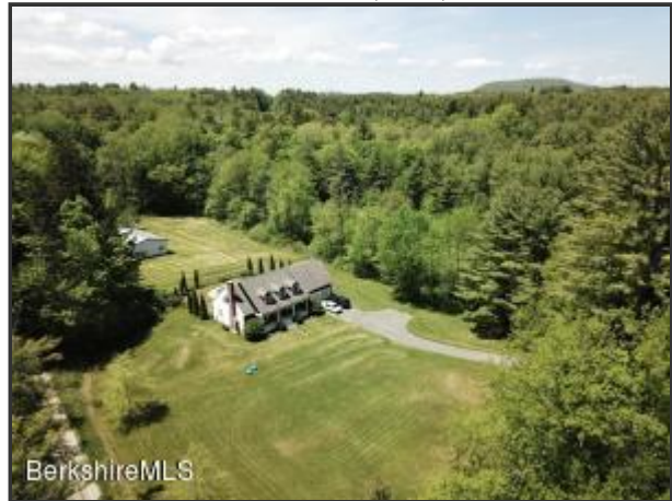
195 Church St, Lee, MA