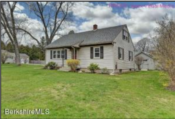
160 Old Pleasant St, Lee, MA