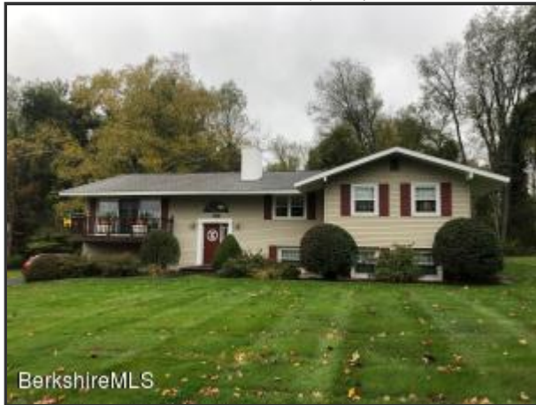
135 Theresa Ter, Lee, MA