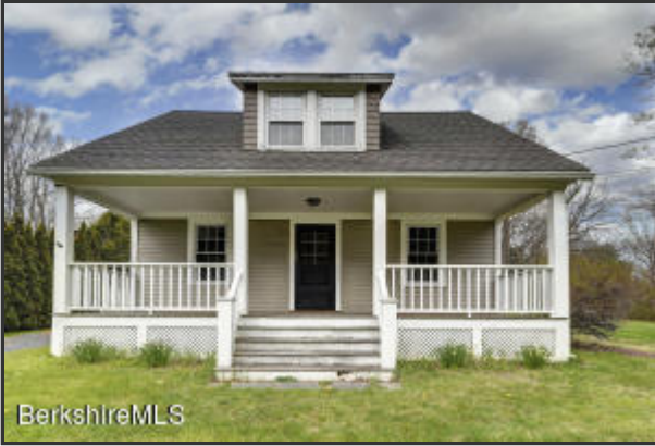
407 Greylock St, Lee, MA