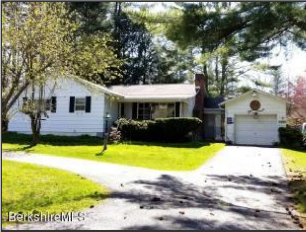
125 George St, Lee, MA