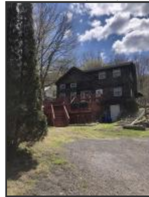
70 Silver St, Lee, MA