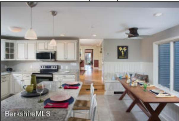
871 East St, Lenox, MA