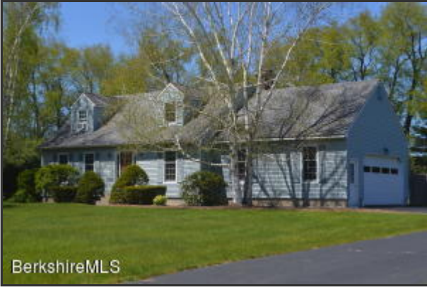
63 King William Rd, Lenox, MA