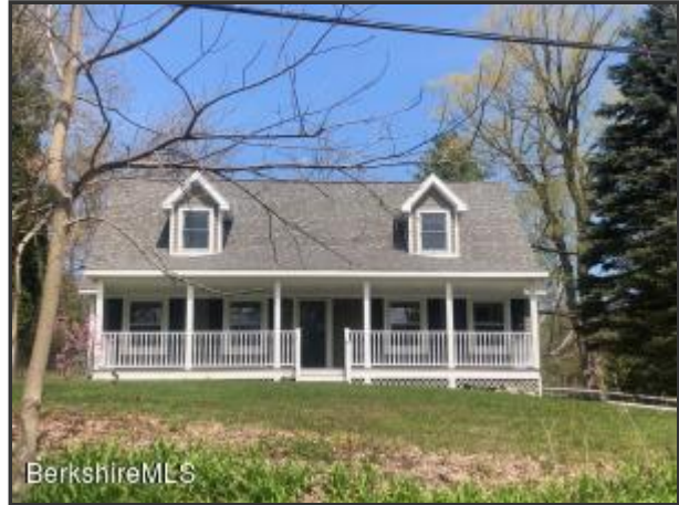
111 New Lenox Rd, Lenox, MA