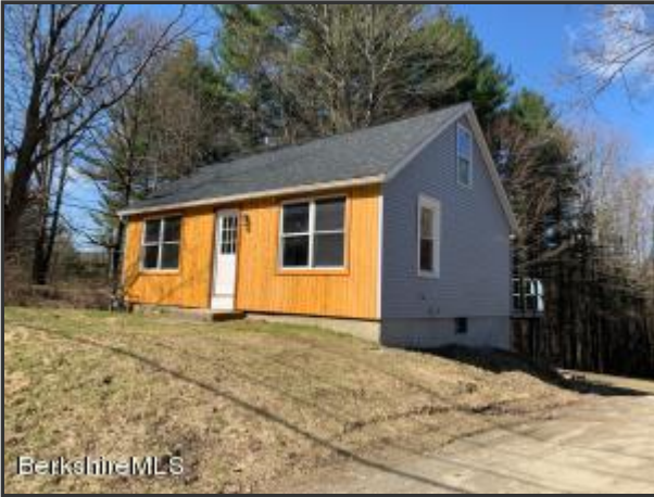
221 Pittsfield Rd, Lenox, MA