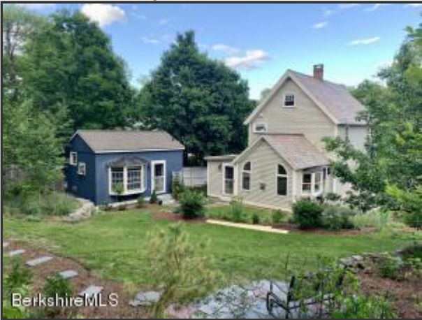
11 Maple Ave, Lenox, MA