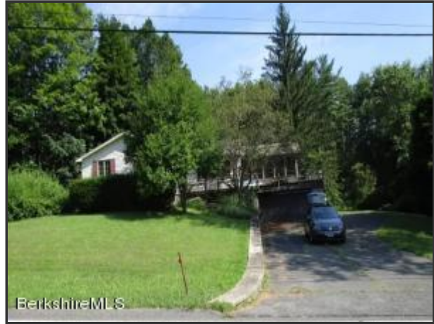
175 New Lenox Rd, Lenox, MA