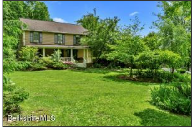
91 West St, Lenox, MA