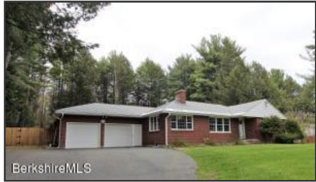
123 Holmes Rd, Lenox, MA