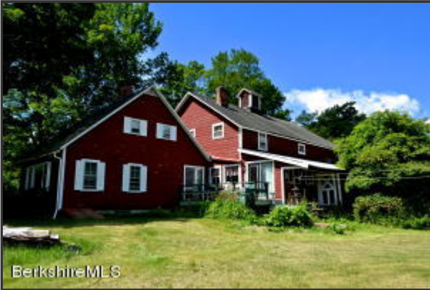
383 housatonic St, Lenox, MA