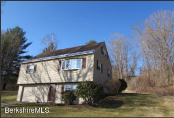
30 Golden Hill Rd, Lenox, MA