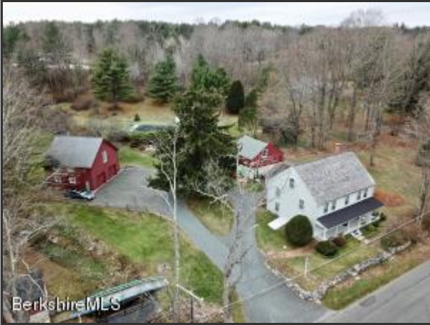
42 Golden Hill Rd, Lenox, MA