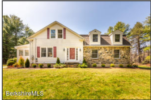
23 Lime Kiln Rd, Lenox, MA