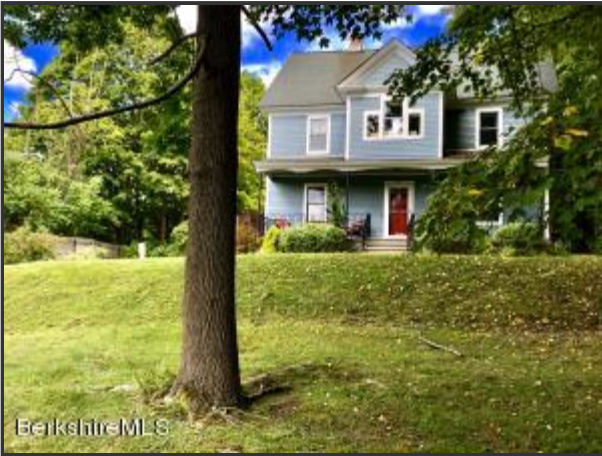
85 Hubbard St, Lenox, MA