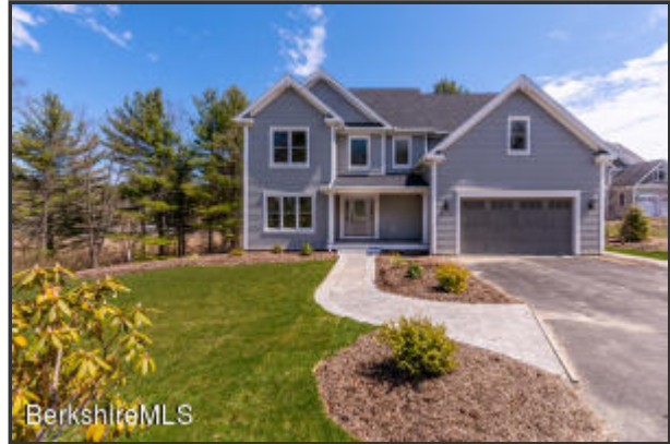
1 Melville Ct, Lenox, MA